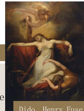
Dido, Henry Fusel - 1781