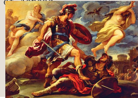
Aeneas defeats Turnus, Giordano – 17 th Century