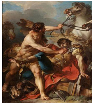
Diomedes Killed by Hercules and Devoured by his own Horses, J.B.M. Pierre – 1752