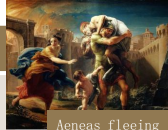
Aeneas fleeing from Troy, Pompeo Batoni - 1753